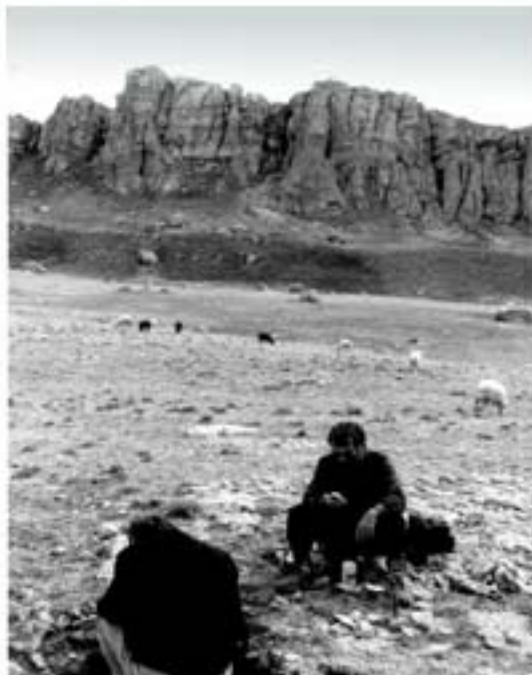
Mountain ziggurat ZIYARET at Mesha-Naxuan

Note: the embedded column walls on the ziggurat as relates to the similar prototypical cliffs at Mesha.