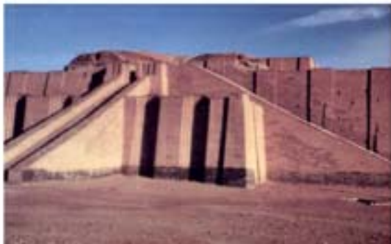
Mesopotamian ziggurat at Ur, c.2100B.C.

A massive geological twin-peaked feature of the site of the city and anchorage of Utnapishtim's ilippu ( ship ). The limestone uplift is approximately three hundred feet of pure white Cretaceous limestone. It is an extremely visible and impressive cliff, which appears as a wall reaching up to heaven as one stands beneath it. This massive, white limestone outcropping is called, on the Turkish maps at present, "Ziyaret" which, quite appropriately, means "shrine." This word is very similar to the Babylonian "ziggurat" before which Utnapishtim made his burnt sacrifice and, in fact, is the prototype and source for the word "ziggurat."